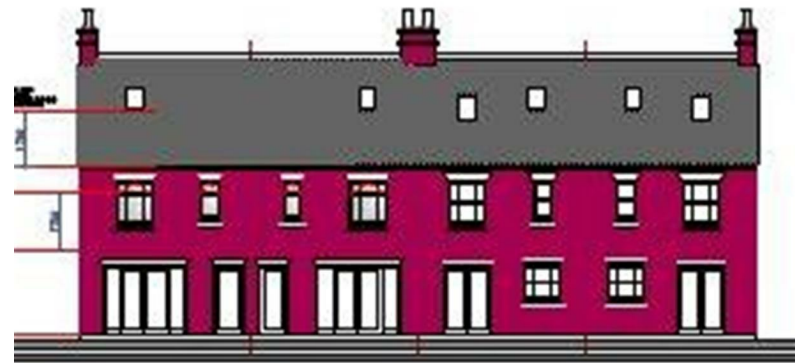
FLOT 4 FLOT 3 FLOT 2 FLOT 1 PROPOSED REAR

Plot 1 Highfield Street, Long Eaton, Nottingham NG10 4GY